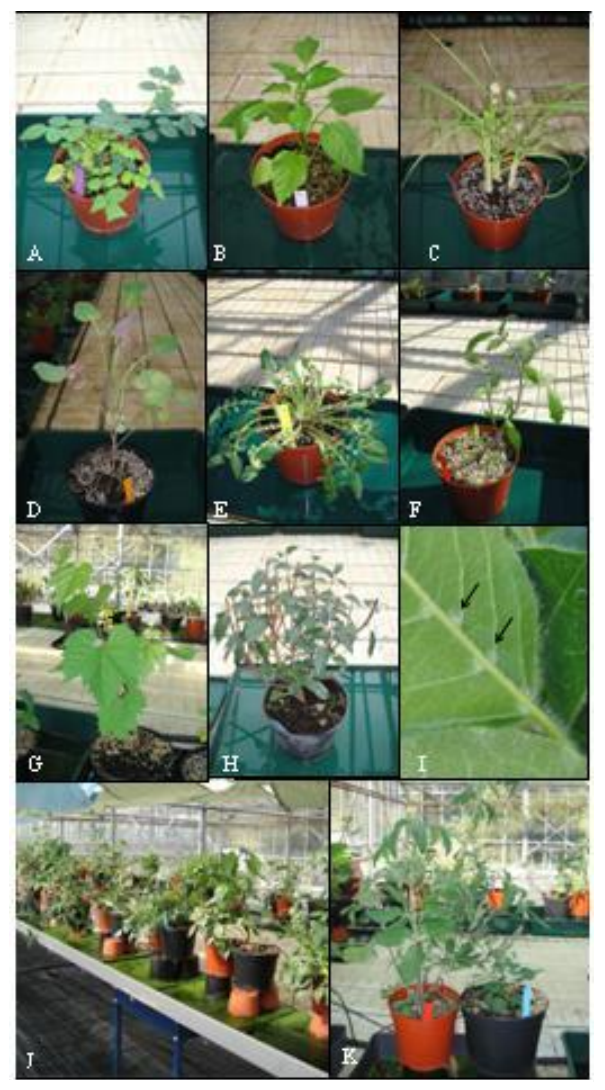
Figure 1. Species of banker plants employed in the experiment. (A) Rosa var. Sonia , (B) Capsicum annuum , (C) Eleusine coracana , (D) Sonchus oleraceus , (E) Crepis nicaeensis , (F) Lycopersicon lycopersicum , (G) Vitis riparia , (H) Viburnum tinus , (I) domatia (arrows) on lower leaf side of V. tinus formed by non-glandular trichomes, (J)+(K) Experimental setting with one individual of each species placed in direct contact with a rose plant, trying to maximize the number of leaves in touch.

dense canopies with many leaves and many stem bifurcations (e.g. Viburnum , Parolin et al. , 2011).